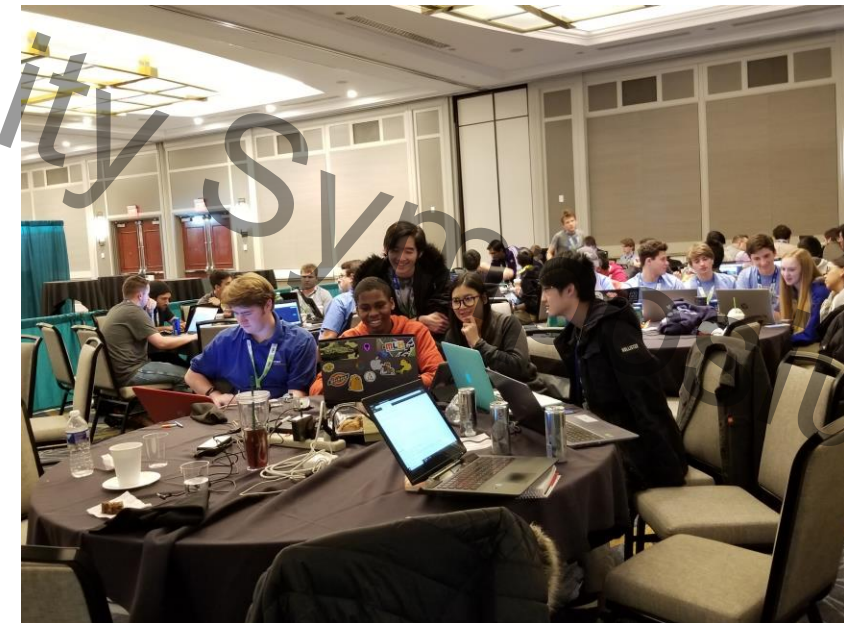
Mid-Atlantic Collegiate Cyber Defense Competition