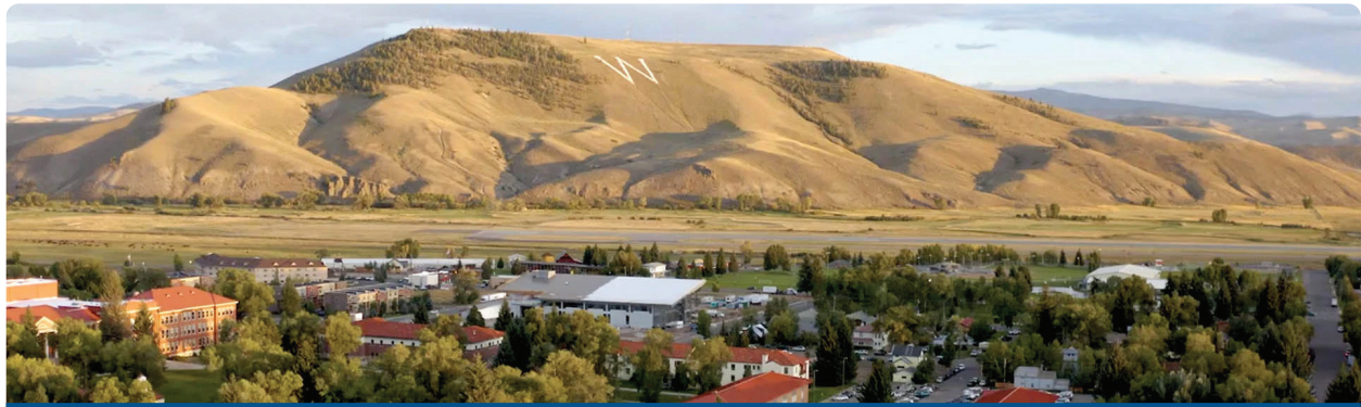
Western Colorado University in Gunnison, Colorado

At Western Colorado University , the Computer Science program focuses on software development, information security and data science. You'll have the opportunity to learn fundamental concepts, languages, tools and techniques in the new, state-of-the-art Paul M. Rady School of Computer Science & Engineering.