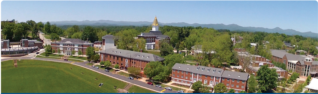
University of North Georgia - Dahlonega Campus

The University of North Georgia is The Military College of Georgia and one of six federally designated senior military colleges in the nation. UNG comprises of five campuses united by the mission of academic excellence that prepares students to become civic, professional, and military leaders. Currently, UNG enrolls more than 18,000 students in over 100 programs of study ranging from certificates and associate degrees to professional doctoral programs.