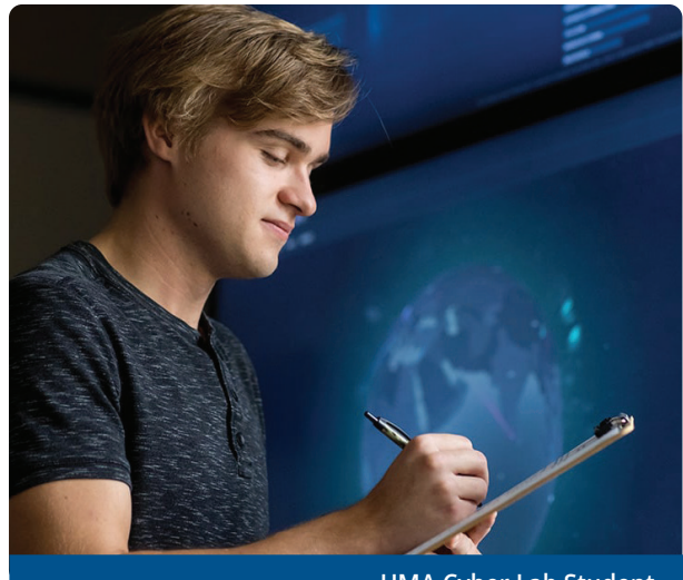
UMA Cyber Lab Student

uma.edu/academics/programs/cybersecurity