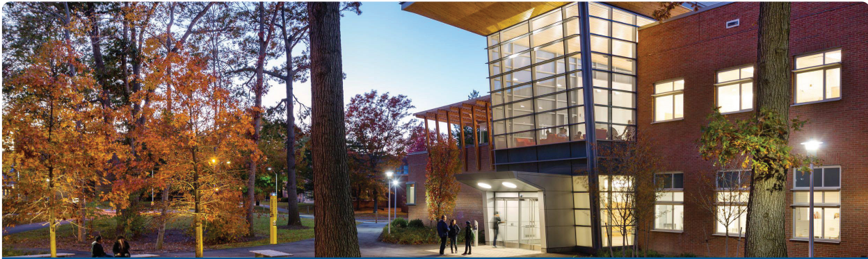
Stony Brook University CS Department

Stony Brook University (SBU) , a flagship institution of the State University of New York (SUNY) system, is renowned for its robust research programs and commitment to academic excellence. Located on Long Island, this top public university offers a diverse campus life and an innovative environment filled with opportunities for its students and community. As a hub for discovery, SBU is continually making significant contributions to science, technology, medicine, and the humanities.