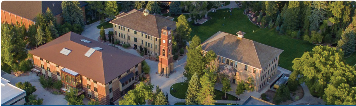
SUU's Campus in scenic Cedar City, UT

The mission of the Computer Science & Cybersecurity (CSCY) Department at Southern Utah University is to provide a learning-centered environment that enables students, faculty, and staff to achieve their goals and to empower our students to compete on a global level for careers in government, industry, secondary education, and acceptance to graduate school. The Department provides programs in computer science and cybersecurity. The curricula are rich with opportunities for students to develop a sound understanding of fundamentals as well as specialized theories, ethics, and hands-on skills that enhance their learning.