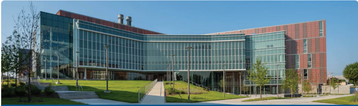
North Carolina A&T Martin Complex

North Carolina Agricultural and Technical State University (also known as North Carolina A&T State University, North Carolina A&T, N.C. A&T, or simply A&T) is a public, historically black, land-grant research university in Greensboro, North Carolina.