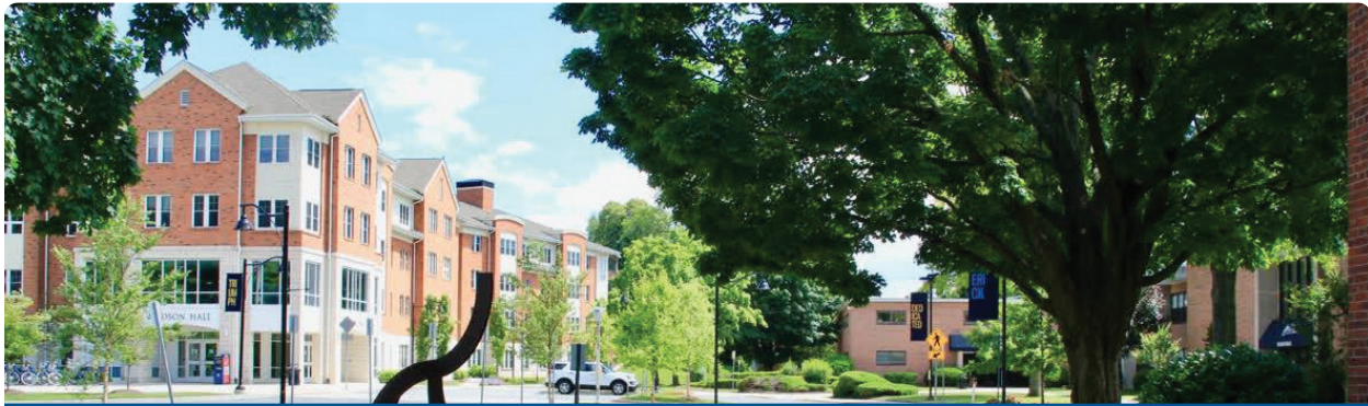
Mercy Westchester Campus

Since 1950, Mercy University has embarked on a mission to revolutionize higher education, tailoring it to meet the evolving needs of our students. We believe that education transcends classrooms and textbooks—it's about igniting passions, driving innovation, and nurturing an unwavering curiosity. We've dedicated ourselves to empowering generations of learners to pioneer new paths and make a meaningful impact that extends beyond individual achievements to enrich families and communities. We are a Hispanic-serving institution nestled in the New York metropolitan area serve around 10,000 students. These students are enrolled across six schools, pursuing over 100 graduate and undergraduate programs.