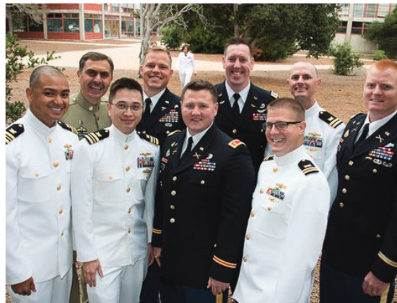
NPS provides graduate education to U.S. Armed Forces, DOD and selected civilians, and international partners