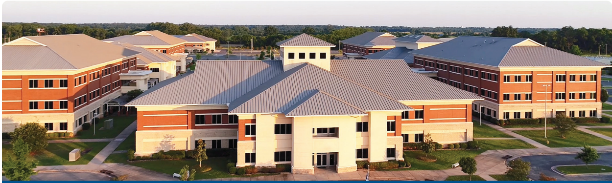
Bossier Parish Campus

Bossier Parish Community College (BPCC) is committed to the area of information assurance in the growing field of cybersecurity as it continues its efforts to meet the needs of the changing work force in the area of information assurance and cyber defense.