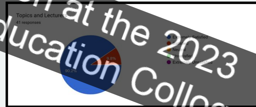
Figure 2. Participant Satisfaction on the Topics and Lectures Presented

This presentation was given at the 2023 National Cybersecurity Education Colloquium